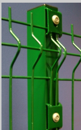
Individual clip fixings