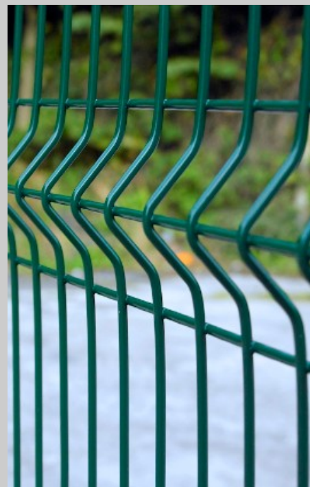
The crimped mesh panel

The budget mesh system enables the user to reap all the benefits of rigid mesh panels at reduced overall cost. Together with the faster and therefore less expensive installation cost, these systems offer a relatively maintenance free budget option.