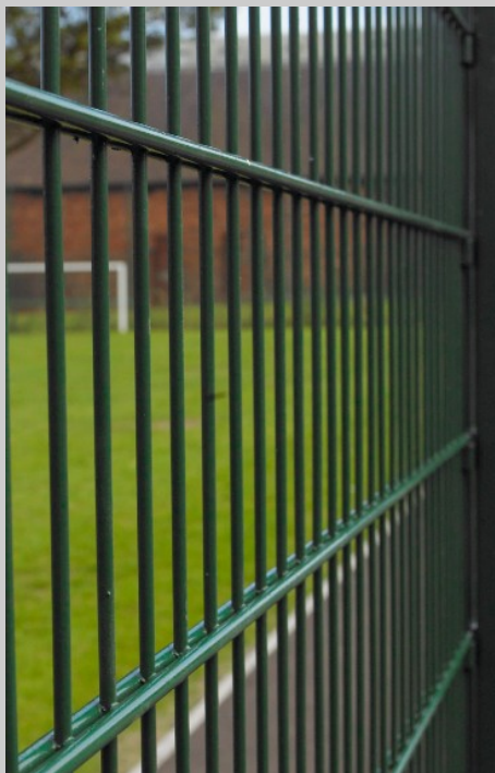
The double wire mesh panel

Pre-galvanised and polyester powder coated Standard colours: RAL 6005 green, 9005 black All other RAL colours available.