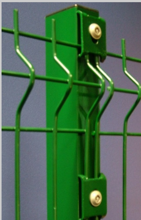
Individual clip fixings

The budget mesh system enables the user to reap all the benefits of rigid mesh panels at reduced overall cost. Together with the faster and therefore less expensive installation cost, these systems offer a relatively maintenance free budget option.